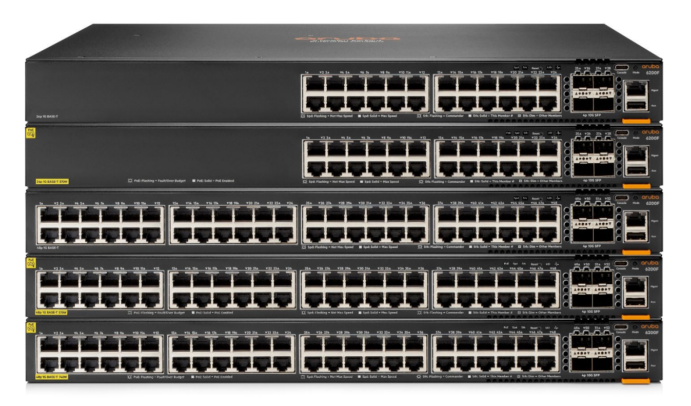
Aruba CX 6200F Switch Series

Aruba Dynamic Segmentation extends Aruba's foundational wireless role-based policy capability to Aruba wired switches. What this means is that the same security, user experience and simplified IT management can be enjoyed throughout the network. Regardless of how users and IoT devices connect, consistent policies are enforced across wired and wireless networks, keeping traffic secure and separate.