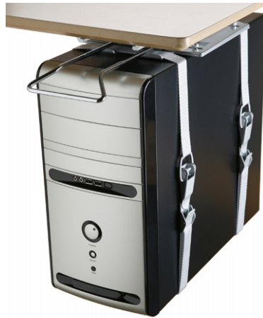
LiftFlex (part no 427-CS27) for high flexibility.