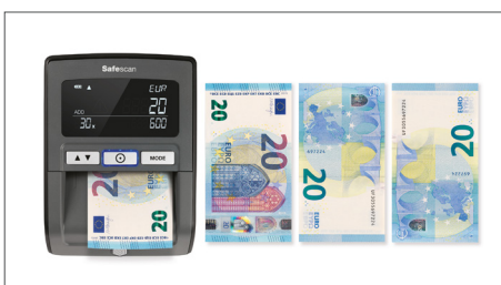
Insert banknotes in any direction