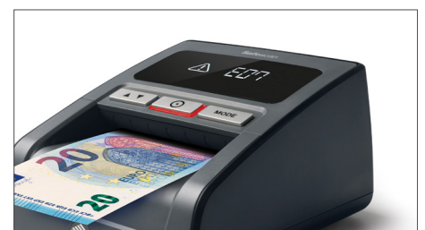
Counterfeit banknote alarm