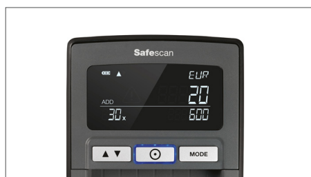
Shows value and total amount of the scanned banknotes