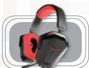
Lenovo Y Gaming Stereo Headset