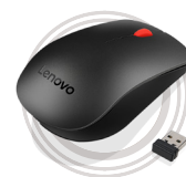
Lenovo 510 Wireless Mouse