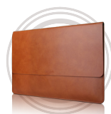
Lenovo 13" Laptop Leather Sleeve