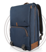
Lenovo 15.6" Laptop Urban Backpack