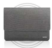
Lenovo Ultra Slim Sleeve